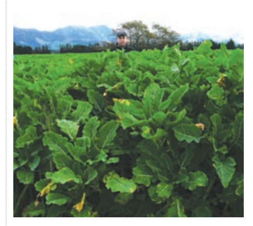
ABOVE: Kale trial at Ruapuna, Canterbury using N-Boost<sup>®</sup>, May 2011 MAIN IMAGE: Pasture and clover growth using the N-Boost<sup>®</sup> System

In trials designed to quantify yield improvement, the overall average yield increase for the N-Boost®